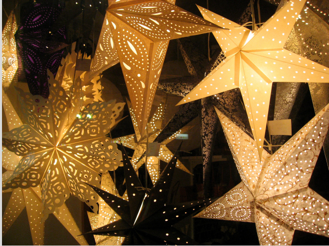
"Advent"

Lord Jesus, Master of both the light and the darkness, Send your Holy Spirit upon our preparations for Christmas. We who have so much to do and seek quiet spaces to hear your voice each day, We who are anxious over many things look forward to your coming among us. We who are blessed in so many ways long for the complete joy of your kingdom. We whose hearts are heavy seek the joy of your presence. We are your people, walking in darkness, yet seeking the light. To you we say, "Come Lord Jesus!" Amen. -Henri J.M. Nouwen