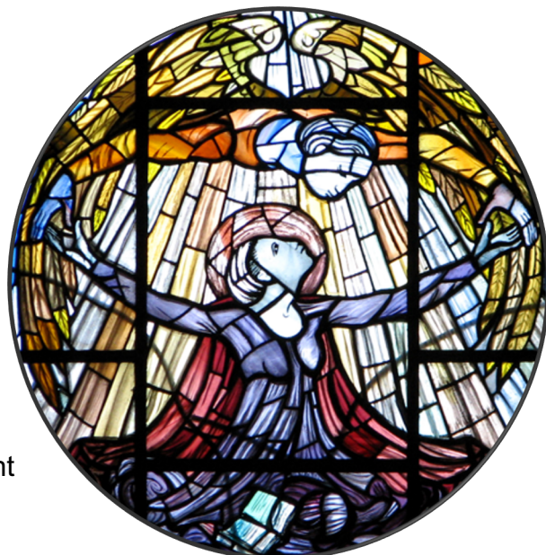
"Embraced by Grace"

Instead of living in a frenzy, let's hit the pause button and Pray, Hope, Give, Rest, Sing, Believe, Love, Praise, Share, Confess, and Trust as we wait upon the Lord.